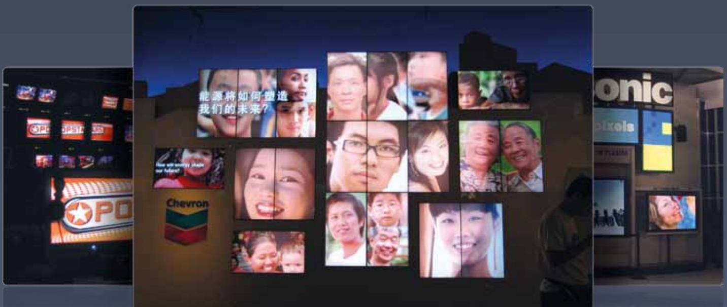
US PAVILION SHANGHAI EXPO