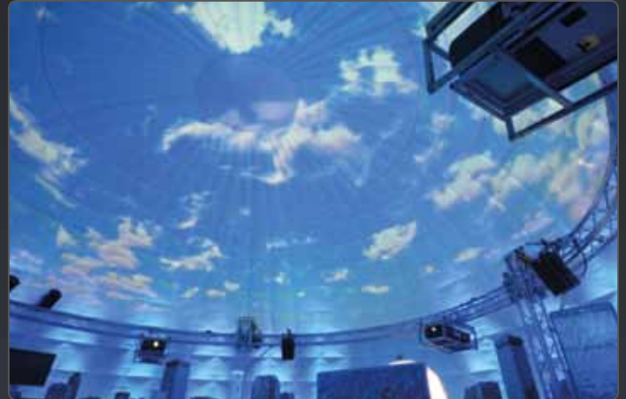
MOBILE DOME – fournell Showtechnik

You can use the powerful features of the built-in timeline or connect a DMX console to get full access to all parameters. Industry standard protocols support any external control via TCP/IP, SMPTE, MSC, SACN, MA-NET Art-Net and DMX512 and many more.