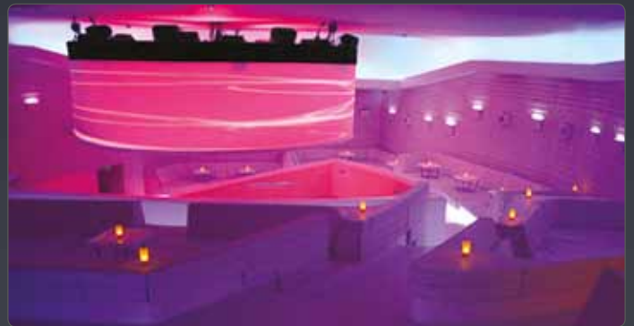
VERTIGO - Zurich

Use two dongles in a single PC system to double up your output and layer count in DUAL MODE