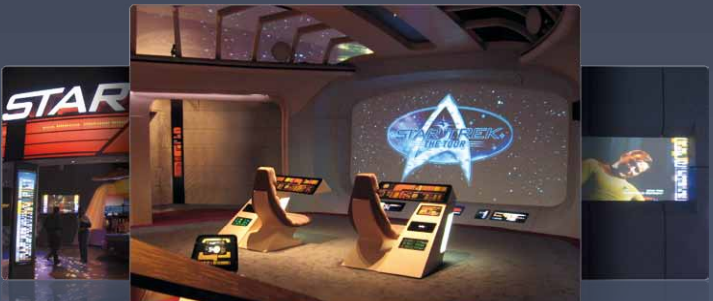
STAR TREK THE TOUR