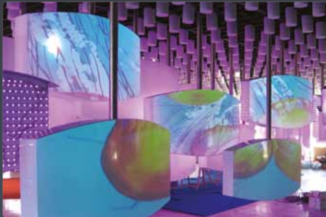
SIEMENS MEDICAL - fischerandfriends

An optional HD Mpeg Encoder is also available for direct media conversion.