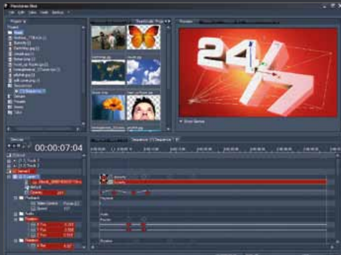
Screenshot User Interface

Arrange videos and images freely, change colour, form and position. Pandoras Box synchronizes all video & audio sources. On-site 3D rendering, composition and editing make Pandoras Box the perfect choice for any live event or multi-media show.