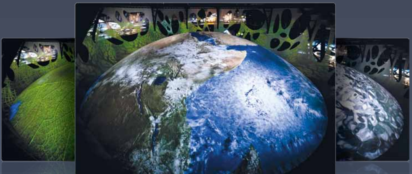
BLUE PLANET SHANGHAI EXPO

The Softedge Blending feature works hand in hand with the built-in warping technology. This way either flat or shaped projections can be set up with multiple projectors. Each output can be offset independently and features individual control of the blend settings on each side of the output to allow both horizontal and vertical blend setups.