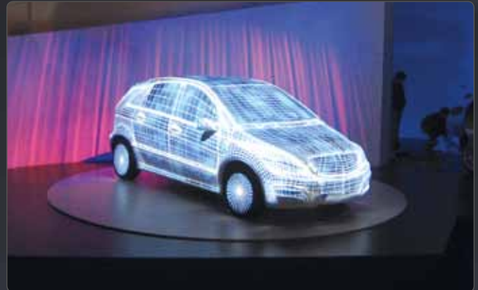
Mercedes B-Class Launch - China