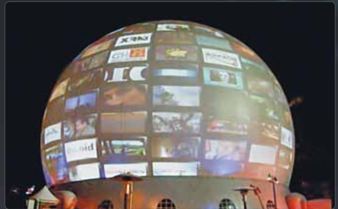
Direct TV - FireFly LA

One of the key features of Pandoras Box Server Systems is the broadcast quality of the low-latency video and PC input options. Featuring both SD and HD-SDI inputs with as low as 2 frames of processing time, Pandoras Box Server Systems come with a set of real-time de-interlacers to process interlaced camera feeds at full framerate.