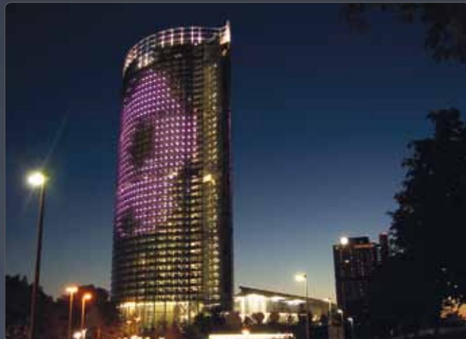
DMX Matrix - Post Tower Bonn

As the HD format has become the standard for large scale projection, all Pandoras Box Server Systems support high-definition video playback, with a maximum playback resolution of up to 4K. The built-in Media Encoder allows you to convert regular footage as well as custom resolutions to the right format depending on your project requirements.